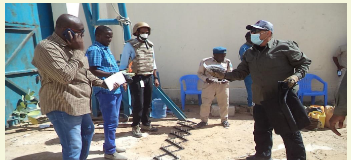
Mogadishu: 10 December 2020: IESG and UNSOS staff brief NIEC security staff on use of spike strips

IESG provided a number of capacity building/training opportunities to NIEC staff to support operations, including: performance management and training development for the Human Resources Department (14 December 2020); procurement evaluation procedures (21-28 December 2020 and 18 January 2021); electoral materials supply chain management training (28 December 2020); M&E plan, data collection and reporting (2 December 2020); managing teams (7-10 December 2020 and 19 January 2021); ICT (six weekly sessions in December 2020 and January 2021); and security training (10 and 13 December 2020).