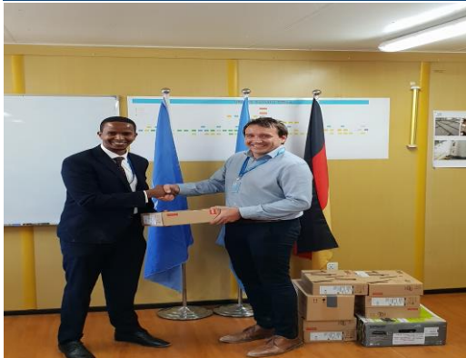
Photo: German D/Ambassador handing over laptops to the Permanent Secretary of the MoS, Galmudug

Mogadishu: On 20 March, UNSOM Police in Mogadishu facilitated the handover of seven laptops and a printer from the German Deputy Ambassador to the Galmudug Ministry of Security (MoS). The equipment was a donation of the German Government and provided on the request of the Ministry of Security in Galmudug due to the imminent arrival of seven new staff members in the ministry. The donation was received by the permanent secretary of MoS. In his speech the Permanent Secretary thanked Germany for the support.