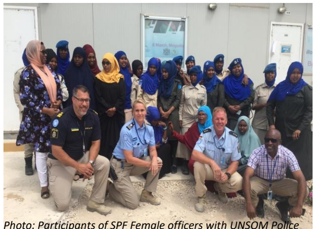
Photo: Participants of SPF Female officers with UNSOM Police

Mogadishu: From 25 to 27 March, the delivery of a three days introduction course for SPF female officers on “Policing, Conflict-Related Sexual Violence (CRSV) and Crimes against Children” was held in JMTC Compound in Mogadishu. The training was planned and organized by UNSOM Police in cooperation with UNSOM Human Rights, UNSOM Women, Child Protection Unit and AMISOM Police. A total of twenty-six female officers from SPF serving in Mogadishu were trained by several experts in various topics such as Human Rights and law enforcement, the role of police in addressing CRSV and child protection in armed conflict settings. All trainees actively participated, shared their experiences and acknowledged that the knowledge gained will assist them to perform better in their work as they contribute to a safer and secure Somalia.