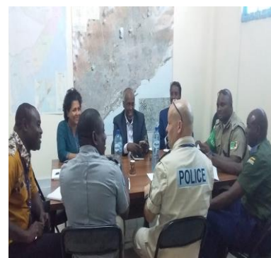
Photo: Representatives of MoIS during the meeting with UNSOM Police

The MoIS officials informed that they are planning to convene the Council of Somali Police Commissioners who will agree on how to deal with the issues and UNSOM Police was assured of their attendance. This would be a significant development towards the desired status of having a permanent advisory role not only to the various Technical Committees but also to the three bodies within the coordination structure (Somalia Technical Working Group – Council of Police Commissioners – Conference of Ministers of Internal Security).