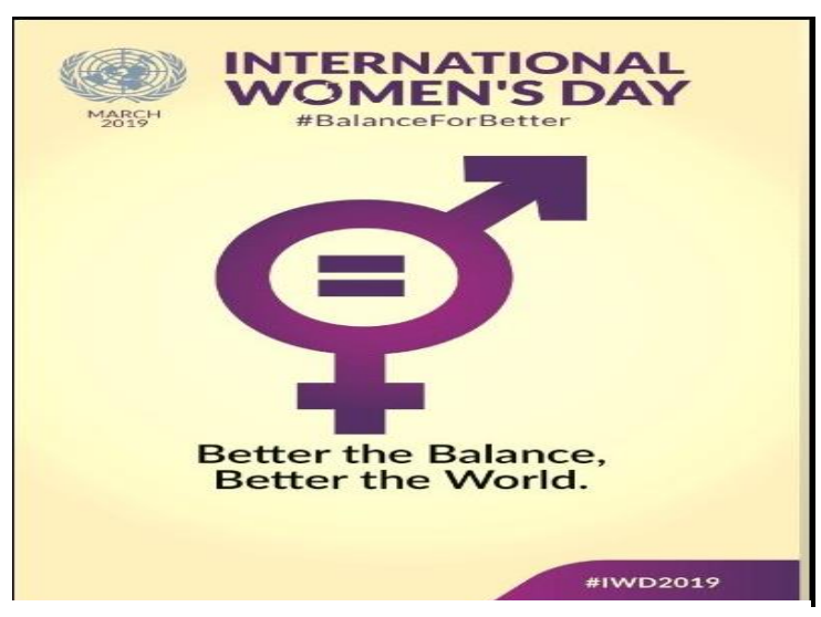
The UN in Somalia marks the International Women's Day 2019.

Gender awareness workshop and CRSV training to SPF