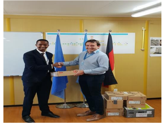
Photo: German D/Ambassador handing over laptops to the Permanent Secretary of the MoS, Galmudug

Mogadishu: On 20 March, UNSOM Police in Mogadishu facilitated the handover of seven laptops and a printer from the German Deputy Ambassador to the Galmudug Ministry of Security (MoS). The equipment was a donation of the German Government and provided on the request of the Ministry of Security in Galmudug due to the imminent arrival of seven new staff members in the ministry. The donation was received by the permanent secretary of MoS. In his speech the Permanent Secretary thanked Germany for the support.