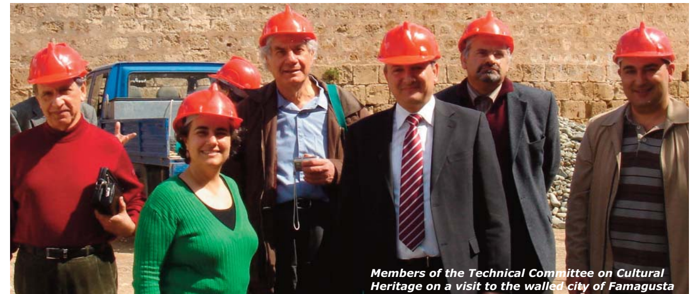
Members of the Technical Committee on Cultural Heritage on a visit to the walled city of Famagusta