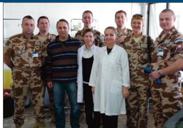
Medical assistants from Transfusion Blood Unit – North Nicosia with soldiers from SLOVCON.