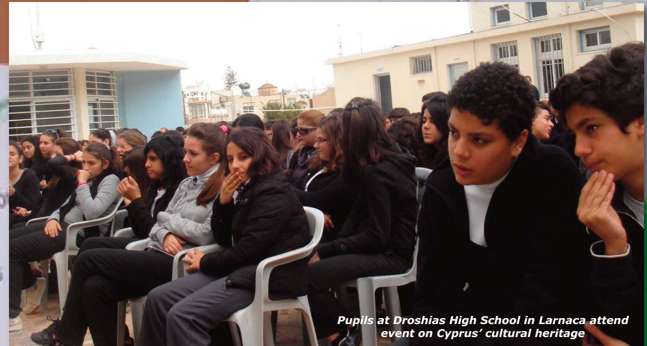
Pupils at Droschias High School in Larnaca attend event on Cyprus' cultural heritage