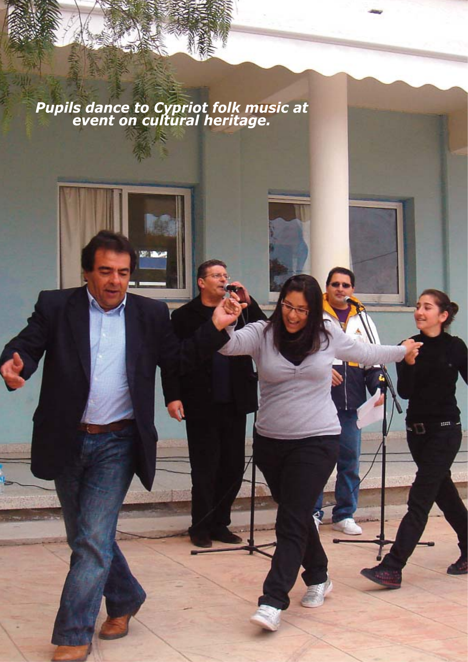
Pupils dance to Cypriot folk music at event on cultural heritage.