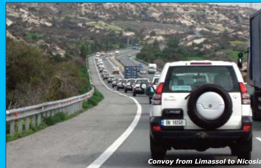
Convoy from Limassol to Nicosia

With the closing of the UN mission in Nepal in October 2008, UNFICYP inherited 31 nearly new vehicles. The lot included 4x4s, 16-seater minibuses and a left-hand drive fork-lift. The vehicles left Nepal in late December 2008 and arrived at Limassol Port and were offloaded on 6 February 2009. A group of volunteers from ISS/Transport Unit, Sector 2 and MFR drove the vehicles from Limassol to Nicosia in two long convoys over a two-day period.