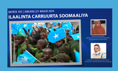
Listen Here: Path to Peace (Episode 395): Protection of Children in Somalia

This dedication to protecting children is exemplified by a recent radio program launched across Somalia in May. Featuring Somali Police Force representatives and a child rights NGO, the program discussed the critical issue of child soldiery and the importance of creating safe environments for all children. It aimed to raise public awareness and encourage action to prevent this harmful practice.