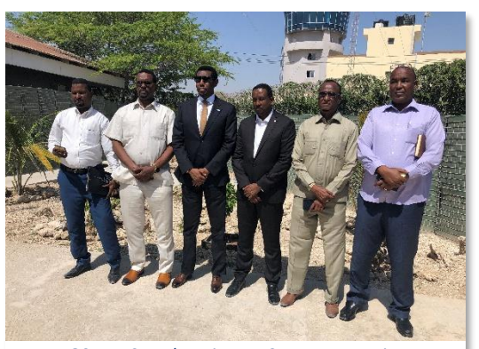
FGS MoIS and senior FMS representatives

enhance security against the VBIED threat in the capital. It was agreed that the next meeting will be convened in March 2019. The strong presence of the Federal Member States and their positive statements on their work with the FGS, especially on the Joint Police Programme, should be seen as an encouraging development. The lack of reference to maritime issues was raised by the EUCAP Head of Delegation.