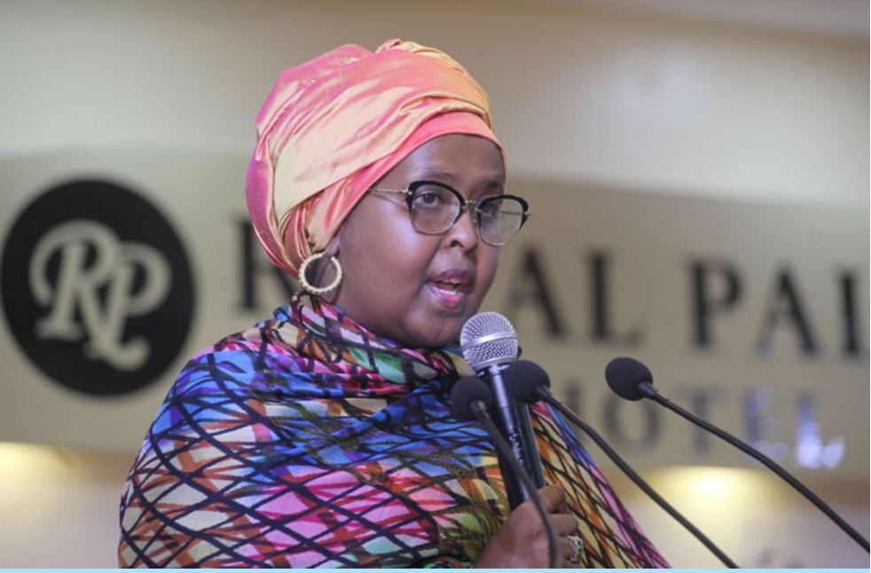
FGS Minister of Women and Human Rights Development Deqa Yassin

"UNSOM supported Somali women's struggle for equal political representation," she said. "The struggle to that end is still ongoing."