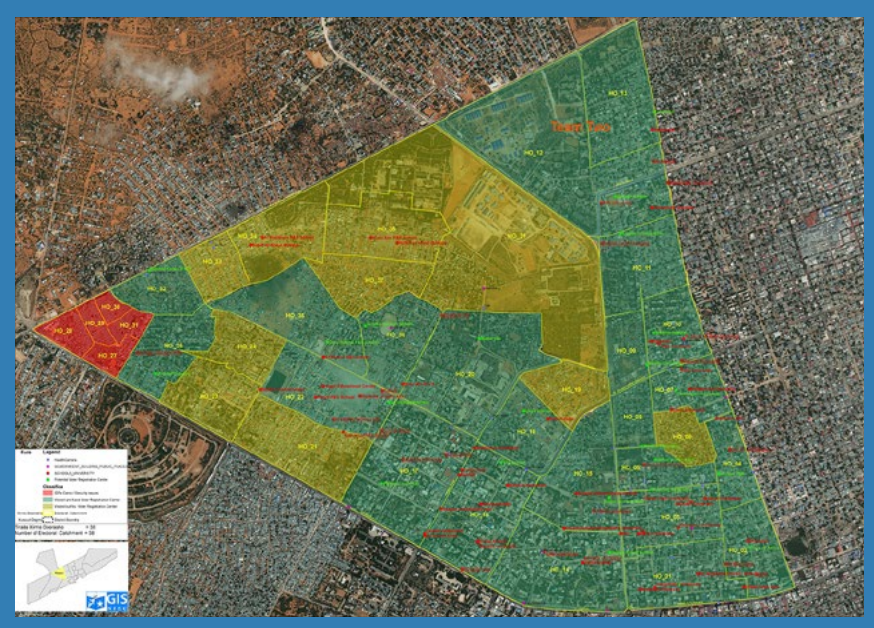
Map of potential voter catchment area in a district of Mogadishu